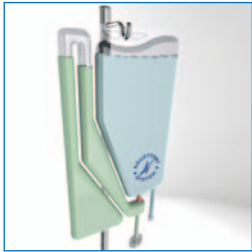
1 - Self-Flushing Infusion bag before use