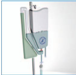
4 - Open the line to infuse the drug