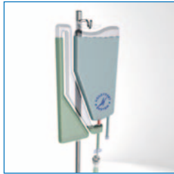
2 - Purge the line