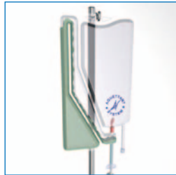
5 - Bag flushes automatically once the infusion is completed

Patent pending: US 2010 0228189 EP 10 162 139.9 (Japan) 2010-287623