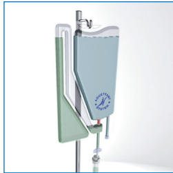
2 - Purge the line