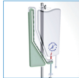
5 - Bag flushes automatically once the infusion is completed