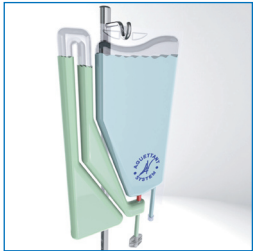
1 - Self-Flushing Infusion bag before use