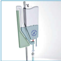
4 - Open the line to infuse the drug